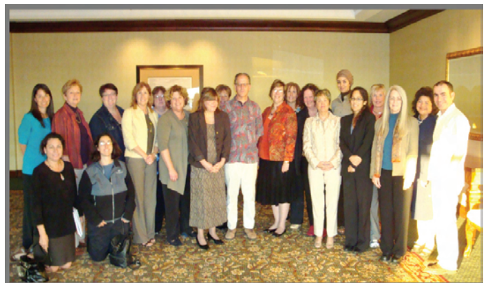
The CAR Council of Faculty Representatives